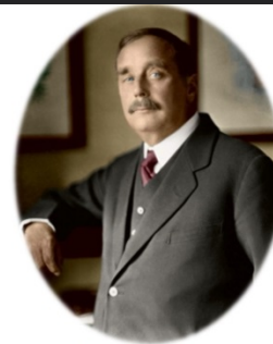
Herbert George Wells