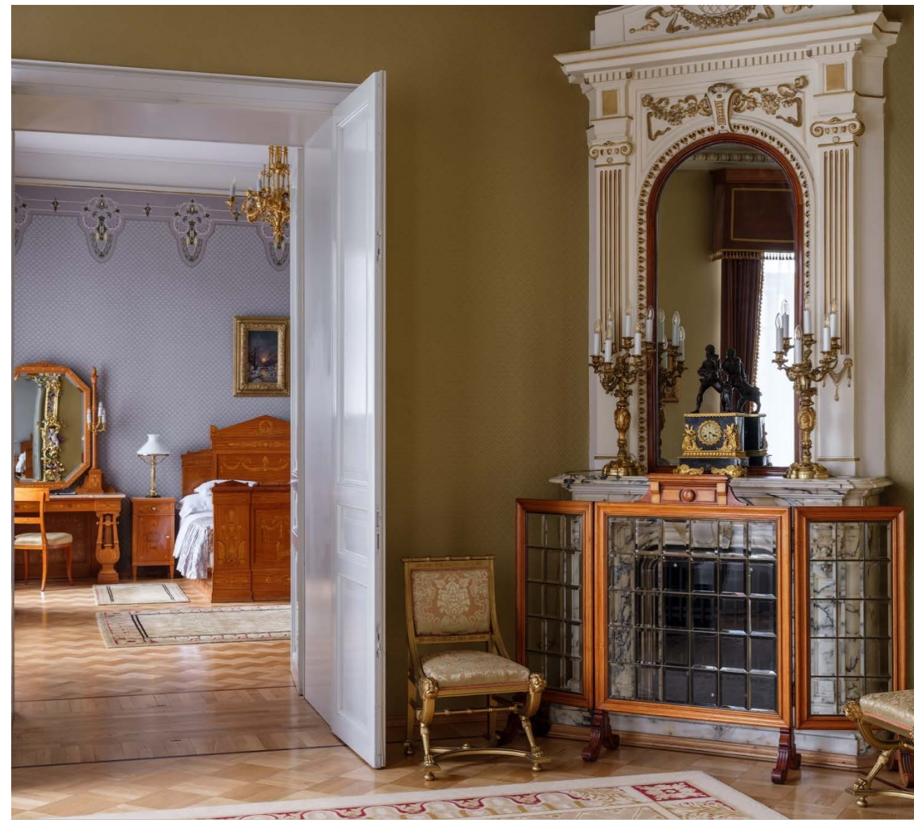
AUTHENTIC FIREPLACE DATED 1903 IN SUITE N°101