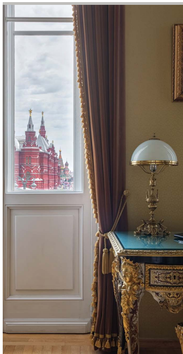
VIEW FROM SUITE N°101