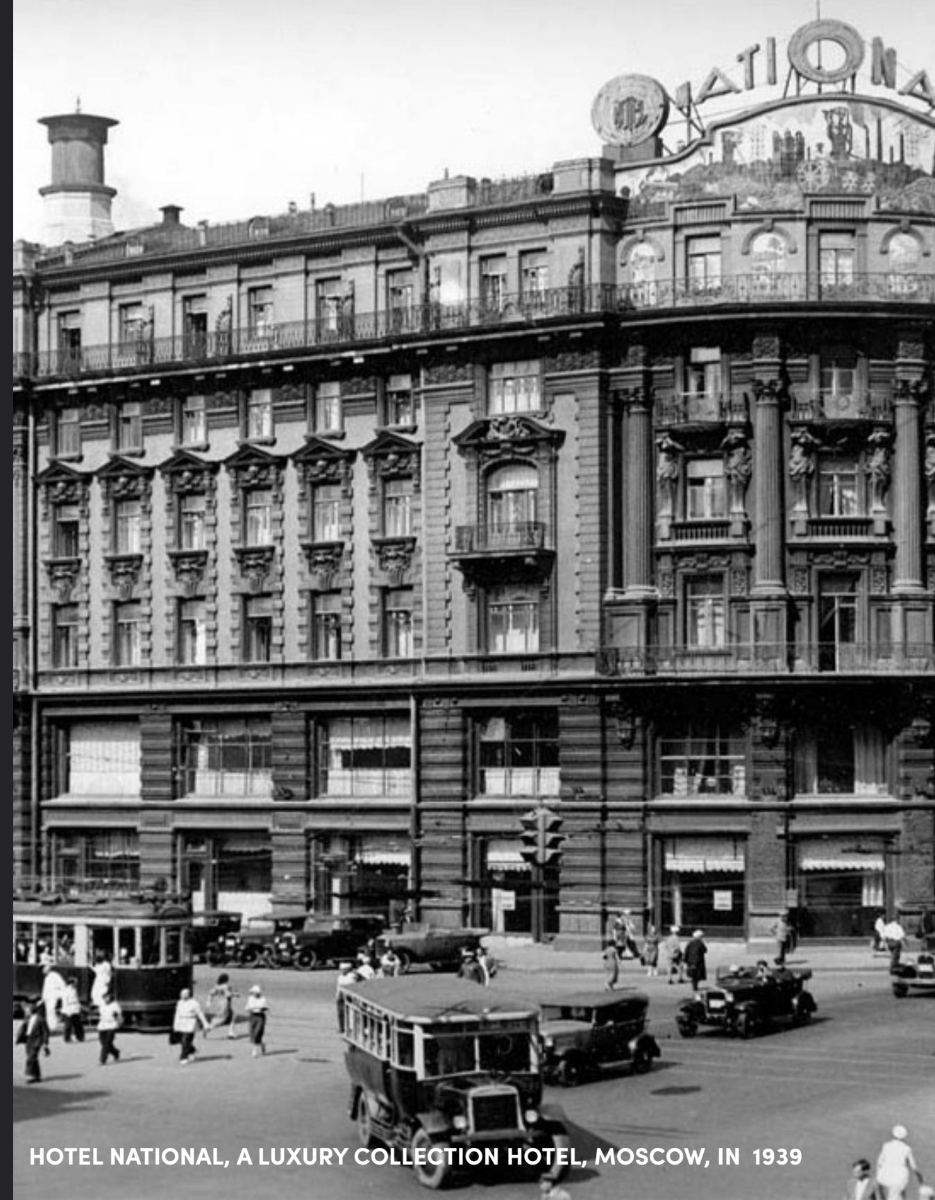
HOTEL NATIONAL, A LUXURY COLLECTION HOTEL, MOSCOW, IN 1939